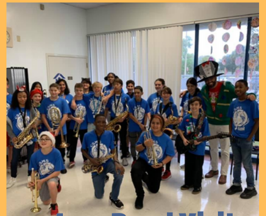
Jazz Band Visit